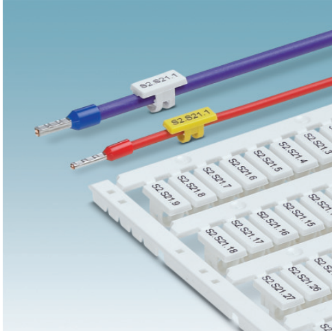
Figure may contain other products.